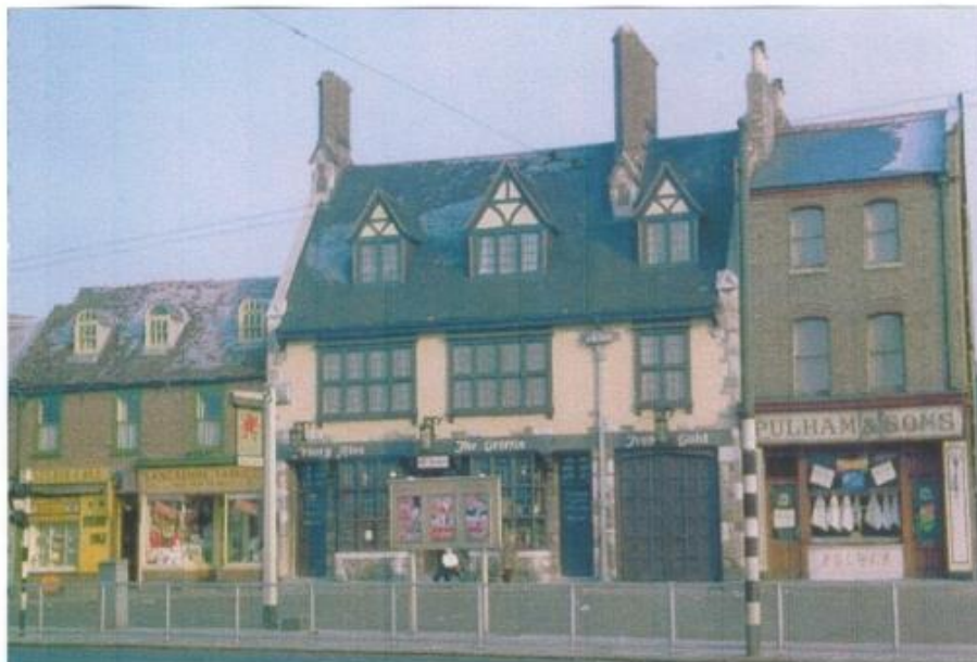
Whetstone, Dec 1961. Studio Cole (extreme left) and Pulhams the butcher (extreme right), both long gone

We all know that things have changed since our parents' days but in the last 20 years the pace of change has increased dramatically. Small businesses