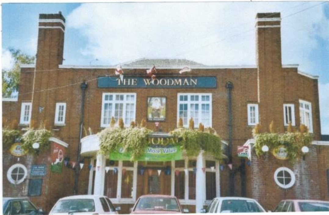
Now you see it..... (Aug 2002)