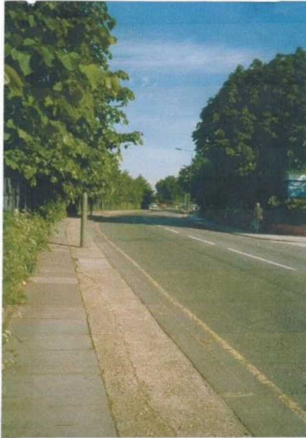
Oakleigh Road South, with the railway line on the left. Limes and hogweed invade the pavement

left, are some iron railings which delineate the railway embankment, and growing up those railings was a line of English lime trees; their branches used to stretch out over the pavement and shade me from the summer sun. At ground level, great fronds of white and green cow parsley would push