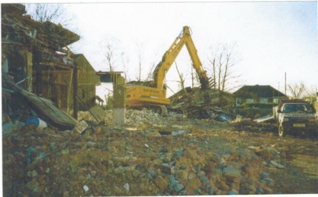
.....now you don't (Jan 2003)