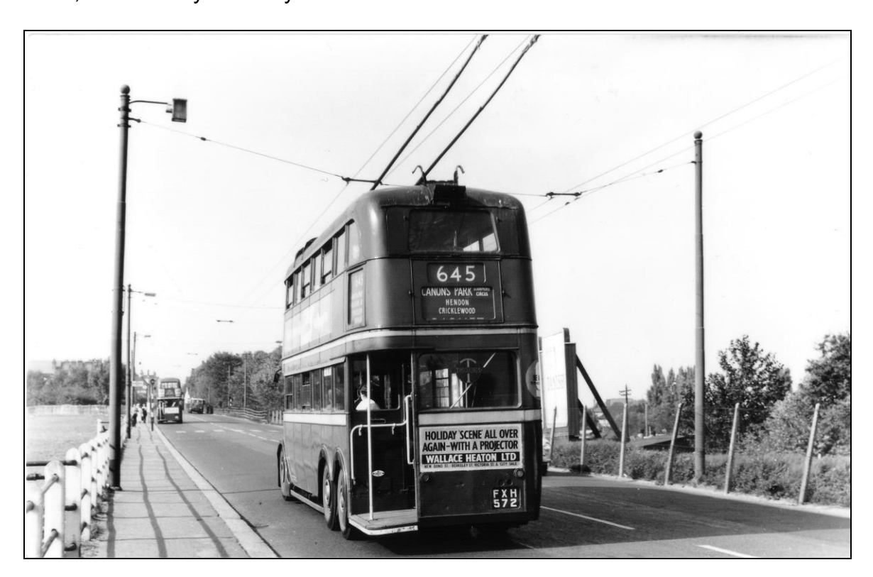
In 1961 a trolleybus starts the long ascent of Barnet Hill

Telford's idea was to scrape away part of the top of the hill, but McAdam suggested building up the foot of the hill. In the end, both courses of action were followed and soil was removed from the top of the hill and deposited at the foot. Other soil was scraped from the surface of neighbouring fields to form the embankment, still visible today near High Barnet station. In 1822 the payment for surveying was 3s 4d per linear foot and the total cost amounted to £1031 5s 11d by far the largest item in the Trust's accounts. Other costs included £810 for team labour, £550 for ballast, £92 for day labour, £18 for interest on the debt and £9 for printing. In 1827 £2000 was borrowed to pay for the improvements – about £223,000 in today's money.