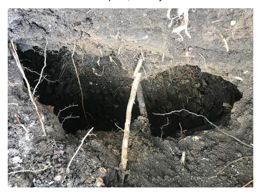
The mysterious hole