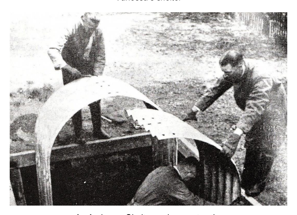
An Anderson Shelter under construction