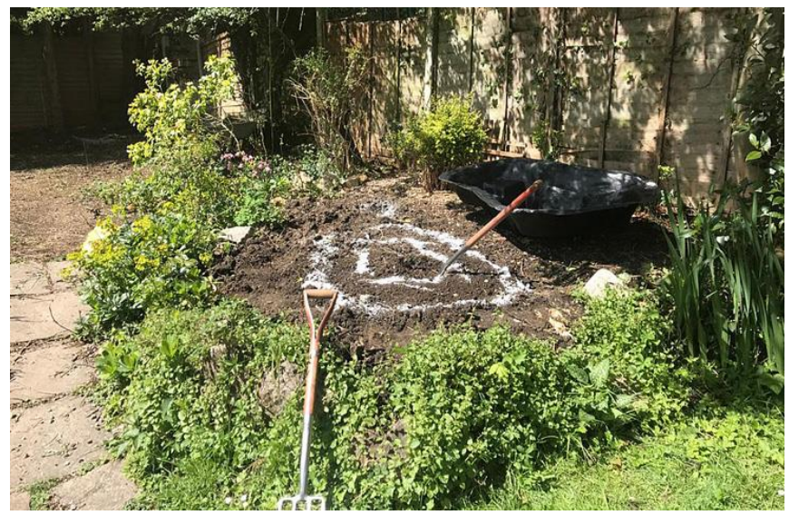
The site of the pond, carefully marked out

A neighbour of ours, Vanessa Salter of 82 Raleigh Drive, was intending to build a pond in her back garden and she and her husband chose a site which consisted of a raised flowerbed. They started digging when suddenly the earth collapsed to reveal a large hole.