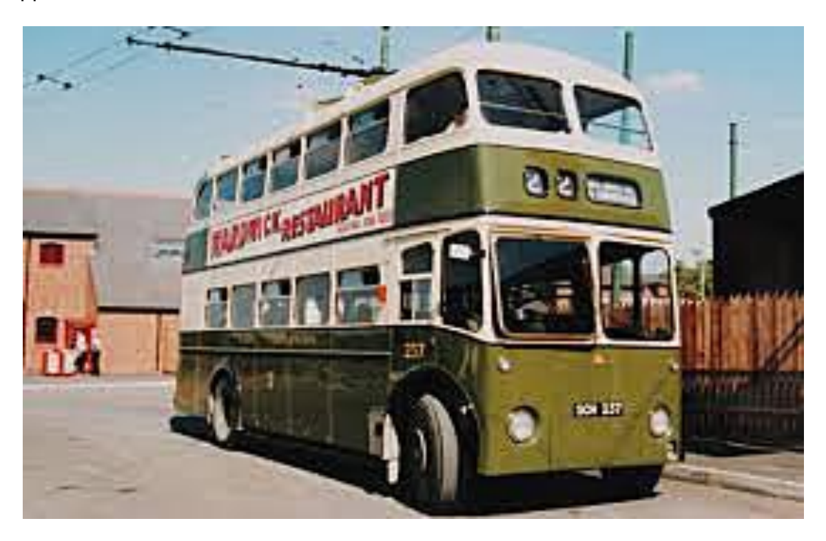
A Derby trolleybus

I went to the main town depot for interview, passed, and spent a bewildering morning training; bewildering because the training embraced both fares collection procedures and, because I had been allocated to trolleybuses, duties specific to these. This came as a surprise as I had expected to work on the usually quieter motor bus routes. There was nothing about safety, neither mine nor passengers' – not unusual in those days, I suppose.