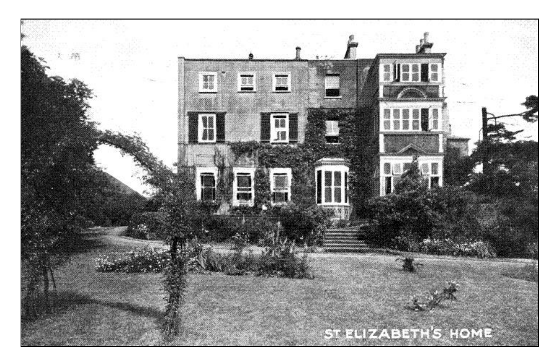
A postcard postmarked 1947.

During the 1939 war there were 30 ladies there, 18 of them bed ridden and looked after by a staff of 8, some of whom were nearly as old as the residents.