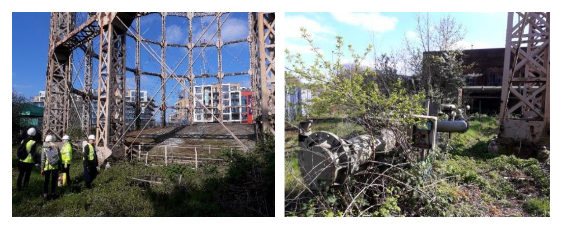
Inspecting the site in April 2019