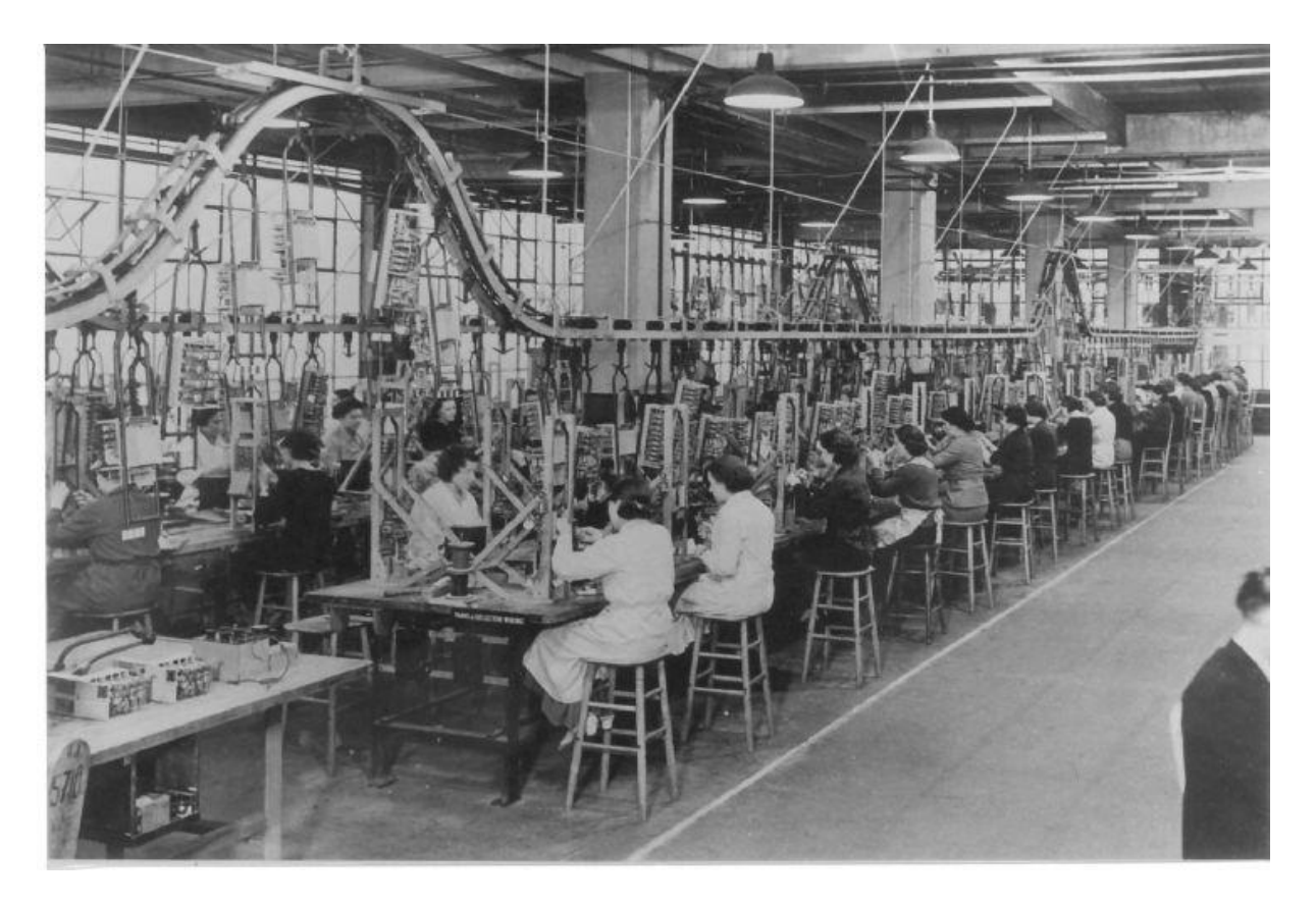
Women workers in Building 3 assembling telephone exchanges

In my research for the writing of 'Firm Friends' I could find no adequate records to help me calculate the total number of people who had worked at STC New Southgate. Consequently I made my own estimate (75,000) which I am sure is not very wide of the mark. The figure, of course, grew during the time Nortel Networks was on the site after buying out STC.