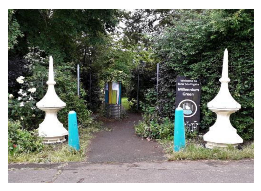
The entrance to the Millennium Green, now with additions

The National Grid Community Relations team were so pleased with the results that they wanted to send out a press release, including a photo of our team with the National Grid team in front of the finials.